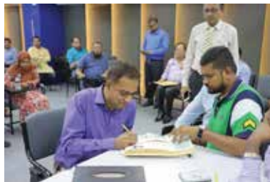
Land signing of 'The Peak', a 20 Katha land at ECB Circle, Dhaka