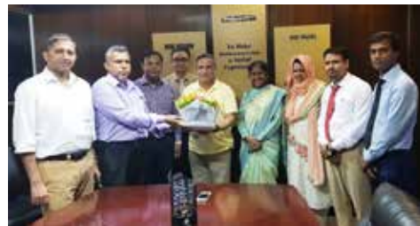
Land signing of 'Sanchari', a 5 Katha land at Mirpur, Dhaka