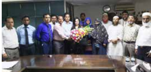
Land signing of 'City Views', an 8.27 Katha land at Khilgaon, Dhaka

We appreciate the trust and faith our landowners put in us. We strive to provide the right value for their most treasured asset.