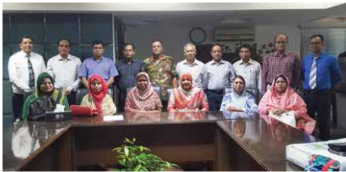
Land signing of 'Valencia', a 43.96 Katha land at Uttara, Dhaka

Our joint venture allows landowners to get the best value for their asset as we ensure the highest quality of construction and on time handover of every project we commit to build.