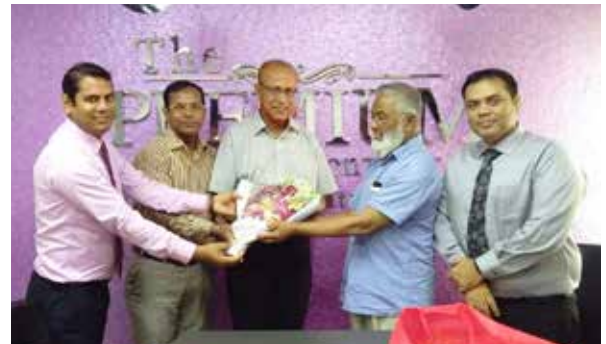
Land signing of 'The Abode', a 5.41 Katha land at Chittagong