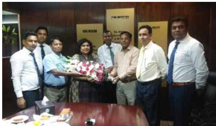
Land signing of Montpellier A 7.41 Katha land at Uttara, sector 03

We are overwhelmed with the trust and faith our landowners put in us. We always strive to uphold our commitment about quality building and on time handover. Here are some amazing moments of land signing ceremony.