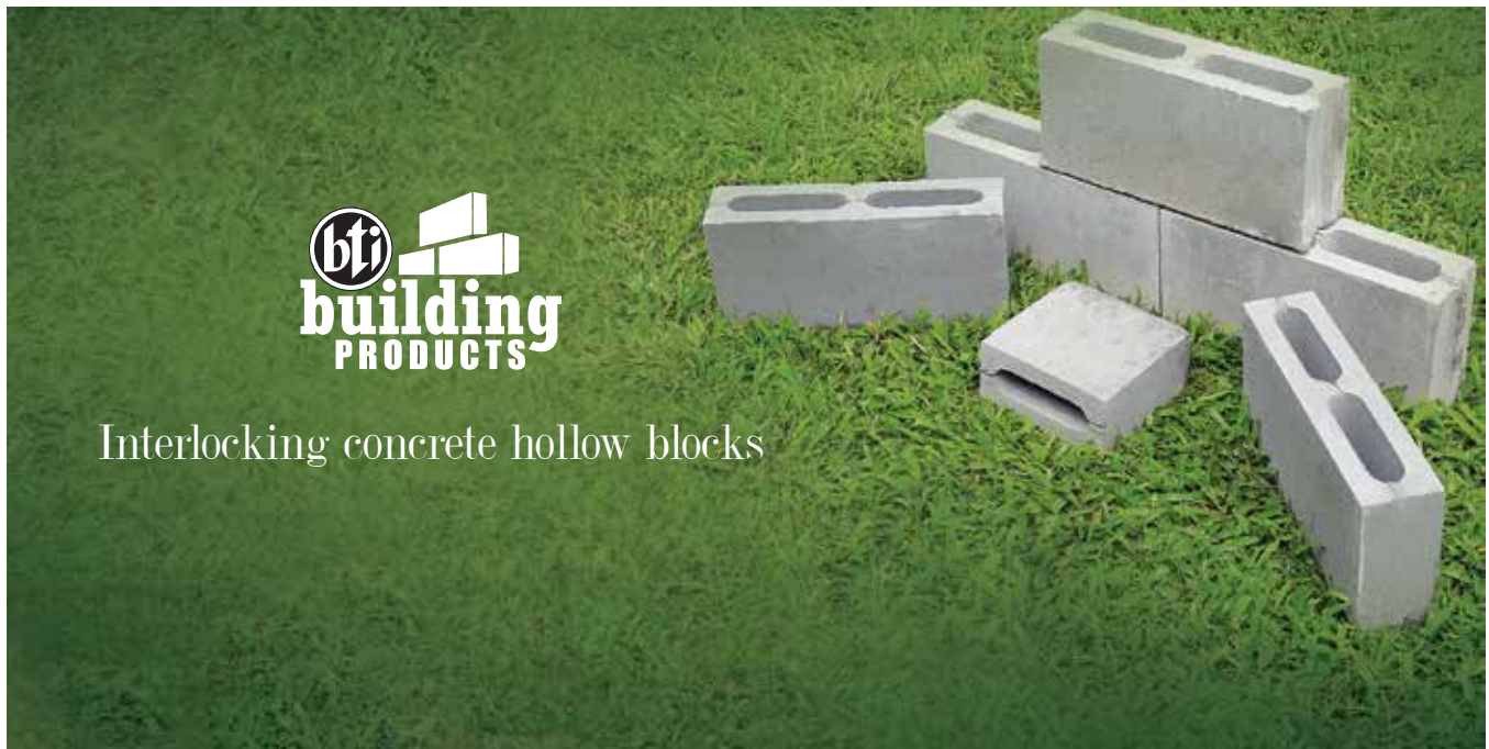
Interlocking concrete hollow blocks