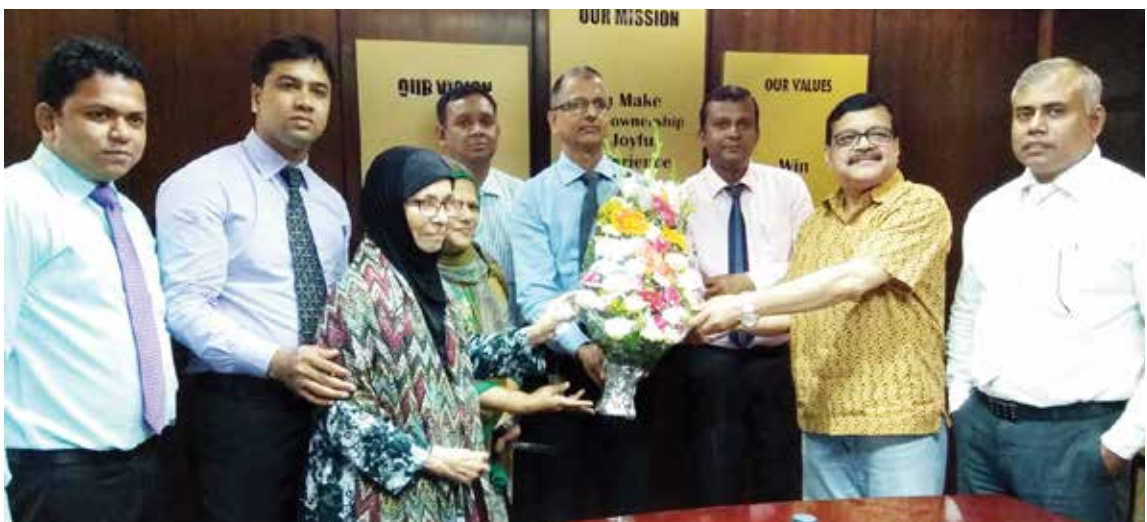
Land signing ceremony of Lily, a 5 katha land at Uttara sector 3