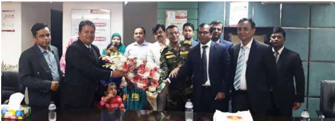
Land signing ceremony of Royal Pines, a 27.5 katha land at Kalshi, Mirpur

We greatly appreciate the trust placed in us by landowners when they handover their most treasured asset to us and we strive to provide the right value for their property. Our team takes into account the wants and needs of landowners as well as customers and incorporates those in the design of a building so that the end result is not just a building rather the fulfillment of their dream home.