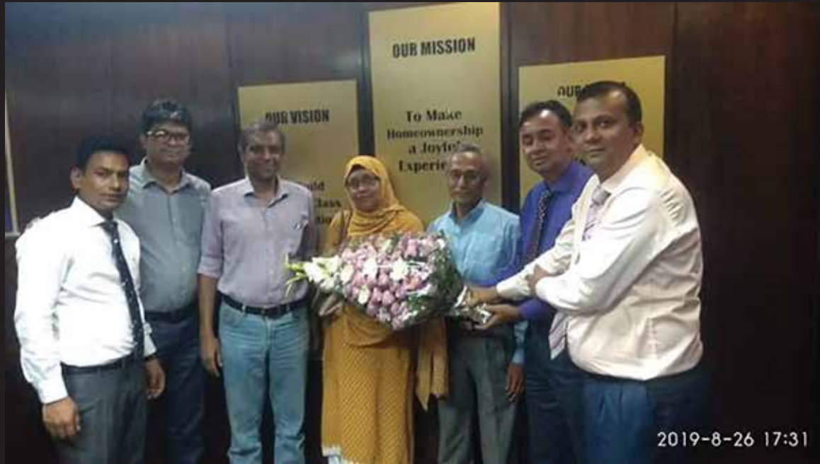
Land signing of 'Oak Land', an 4.09 Katha land at Uttara, Dhaka

We appreciate the trust and faith our landowners put in us. We strive to provide the right value for their most treasured asset.