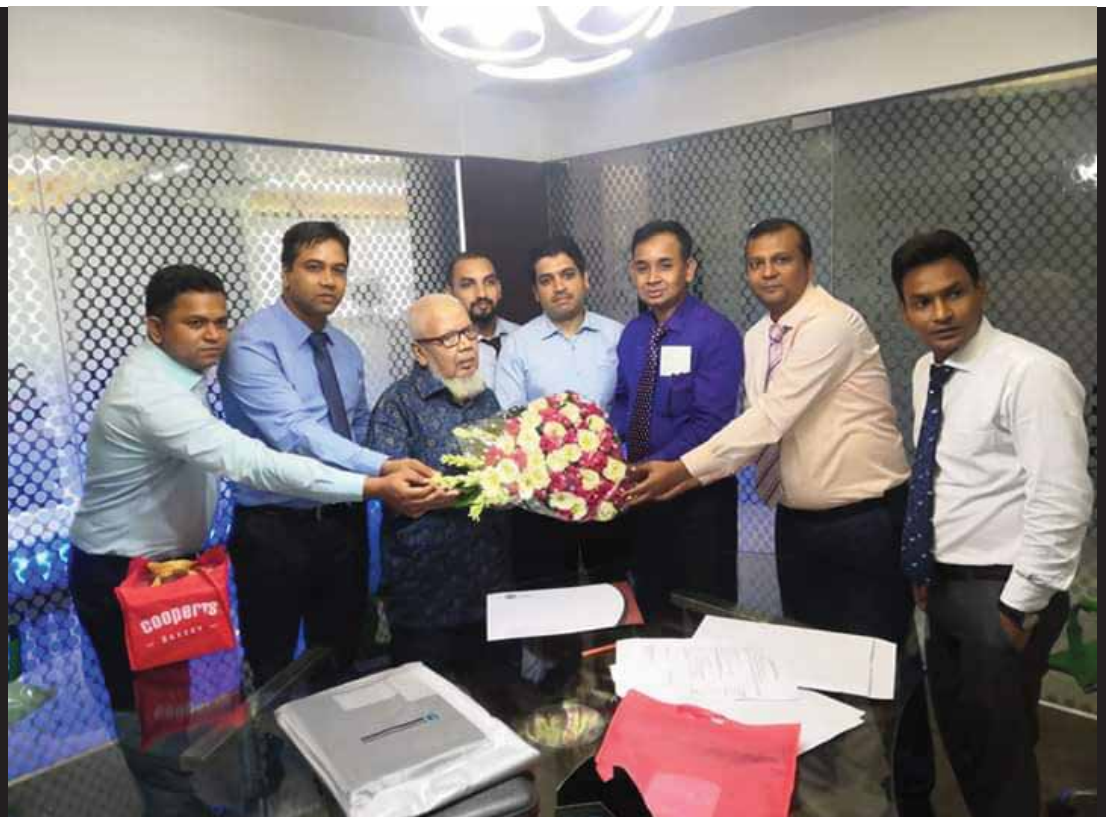
Land signing of 'Pinehurst', an 5.256 Katha land at Uttara, Dhaka