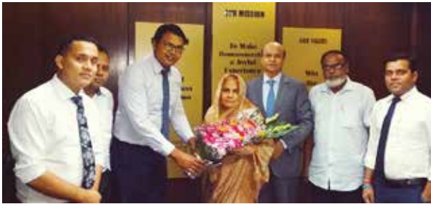
Land signing of The Horizon a 9.09 katha land in Purana Paltan

We appreciate the trust and faith our landowners put in us. We always aim to uphold our commitment of quality and on time handover to our valued landowners who are important members of bti family.