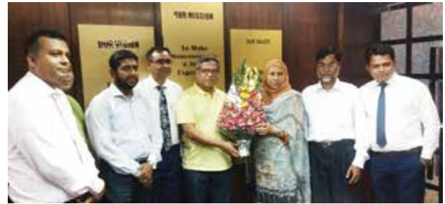
Land signing of La Verna a 5 katha land in Bashundhara R/A