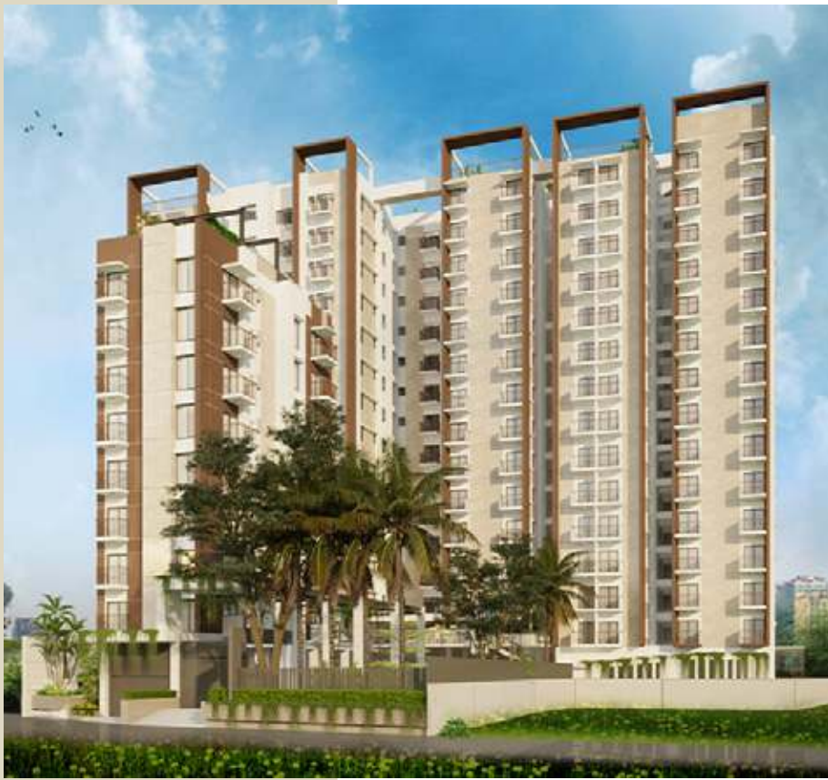
Project: The Millennial

This year, bti has plenty to offer from several of our Collections. We will launch two brand new projects from our Wellness Communities- The Millennial, located on Madani Avenue, and The Madison in Diabari. We are also promoting Royal Pines in ECB Circle, Shopnoneer in Uttarkhan, and Green Valley in Chattogram.