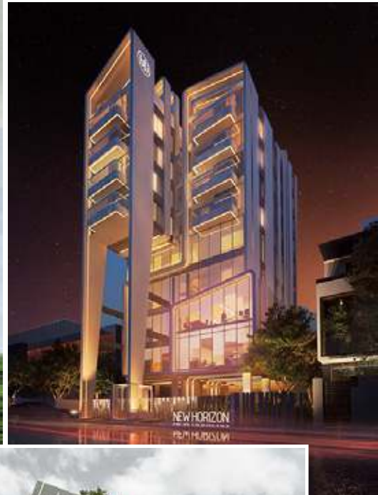
Project: New Horizon