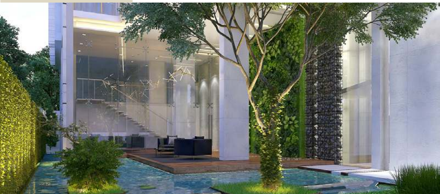
Project: Park Royale

This year, bti has plenty to offer from several of our Collections. We will launch two brand new projects from our Wellness Communities- The Millennial, located on Madani Avenue, and The Madison in Diabari. We are also promoting Royal Pines in ECB Circle, Shopnoneer in Uttarkhan, and Green Valley in Chattogram.