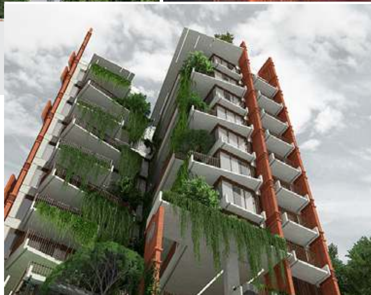
Project: West Gate

That's not all. We are also releasing a spree of homes in Dhaka and Chattogram from our Classic Collection, the most on-demand apartments from bti. These apartments span across a wide number of locations, such as Joarshahara, Wari, Khilgaon, Dilu Road, Khilkhet, East Nasirabad, and Panchlaish. However, the majority of the apartments are in Mirpur and Uttara, so if you are hoping to buy a home there, this is your chance. A residential cum commercial complex named New Horizon in Old Paltan is all set to be launched too.