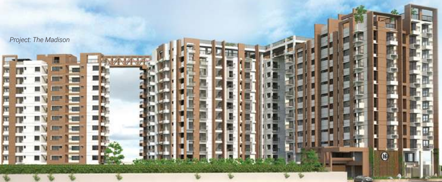
Project: The Madison

The event will start on 5th June 2021 and cover July as well. This is the biggest sales event of the year, where we will host architects, bank partners, sales personnel, legal team, and other relevant authorities for every project. Customers can participate in the launch program via a virtual meeting and learn more information about their desired apartment. They can also opt to visit the site. Of course, we will maintain strict Covid-19 protocols during the entire event. The aim is to ensure that the customer makes an informed decision when trusting bti to develop their dream home.