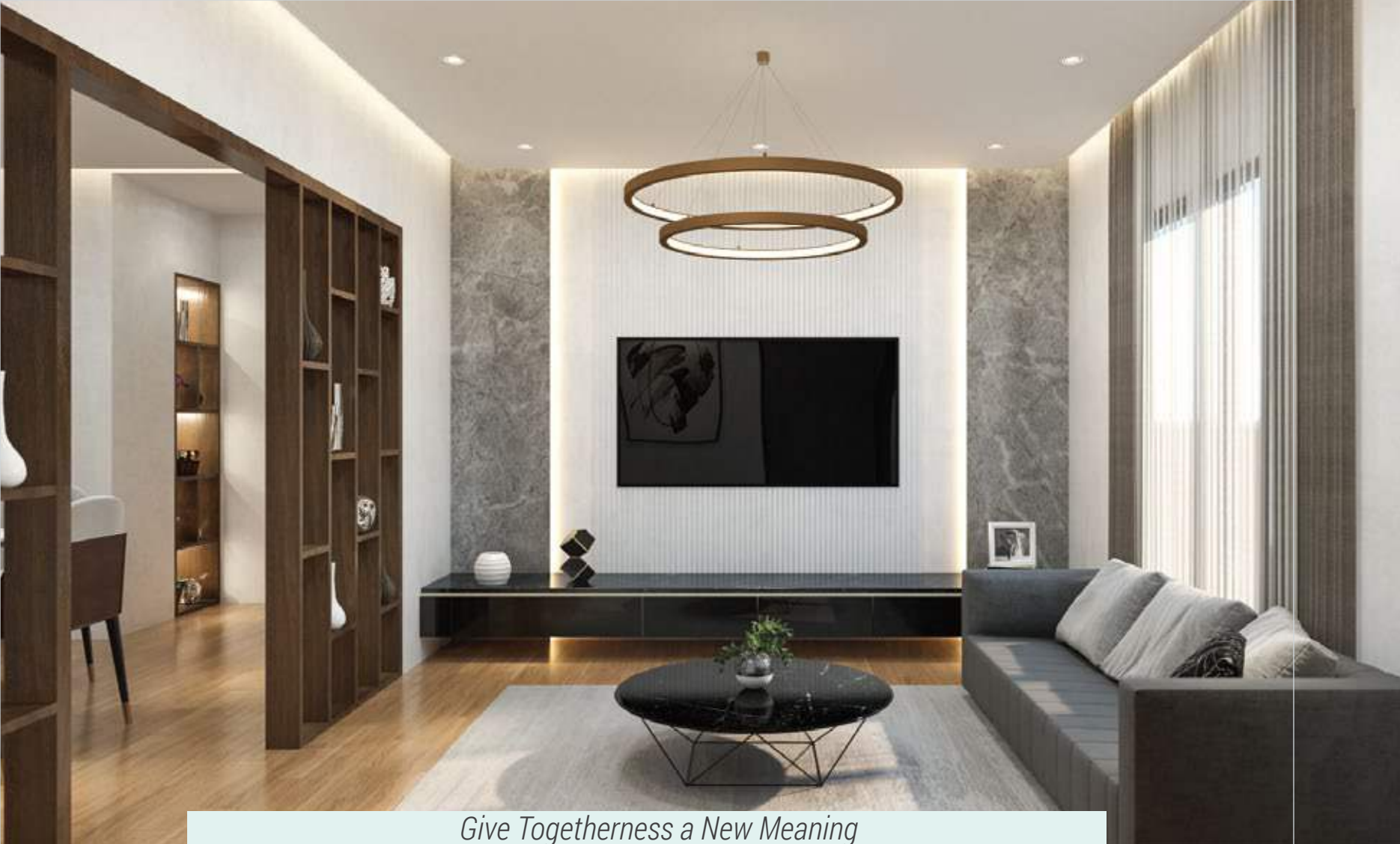
Give Togetherness a New Meaning