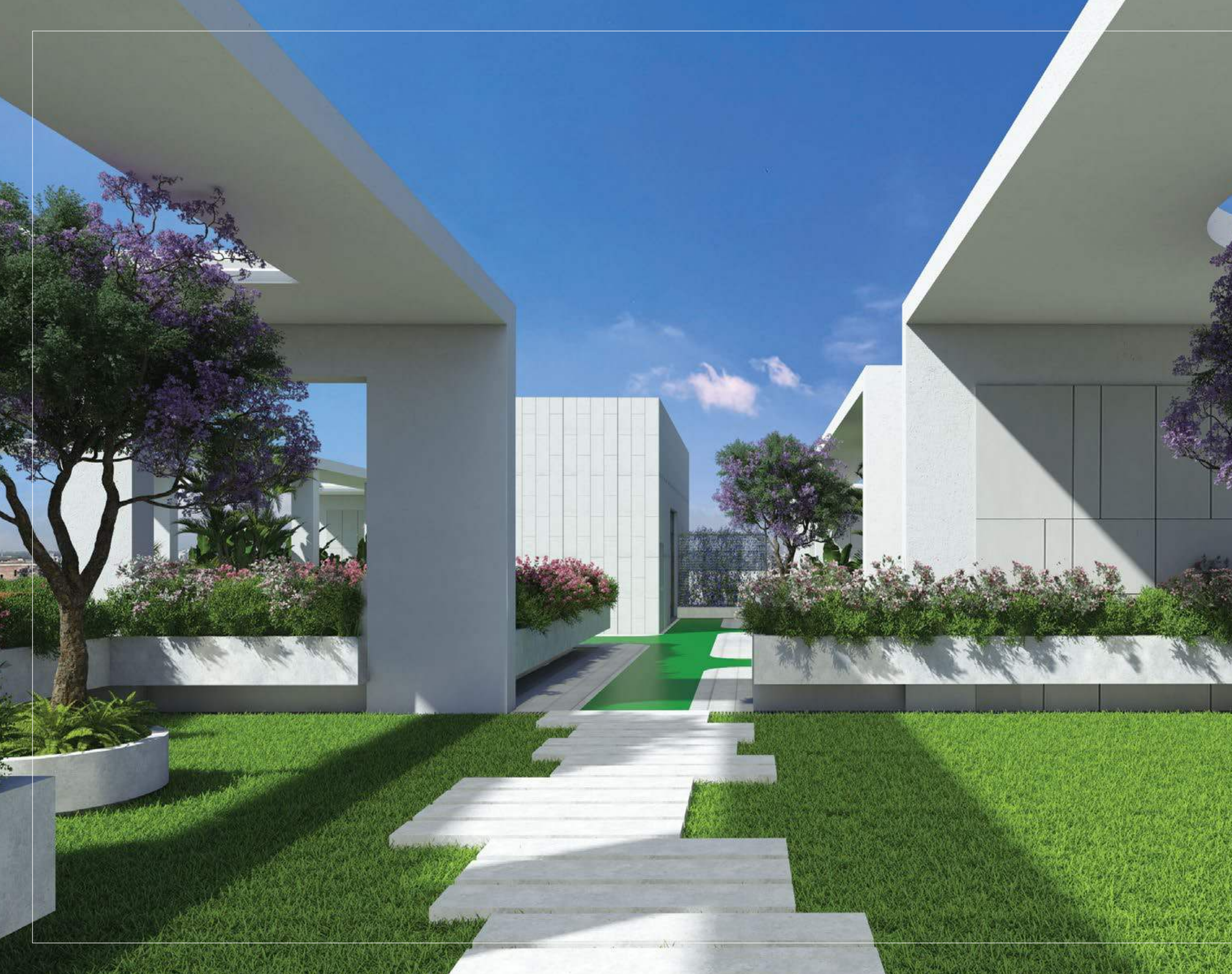
— Take A Walk In The Midst Of Serenity —