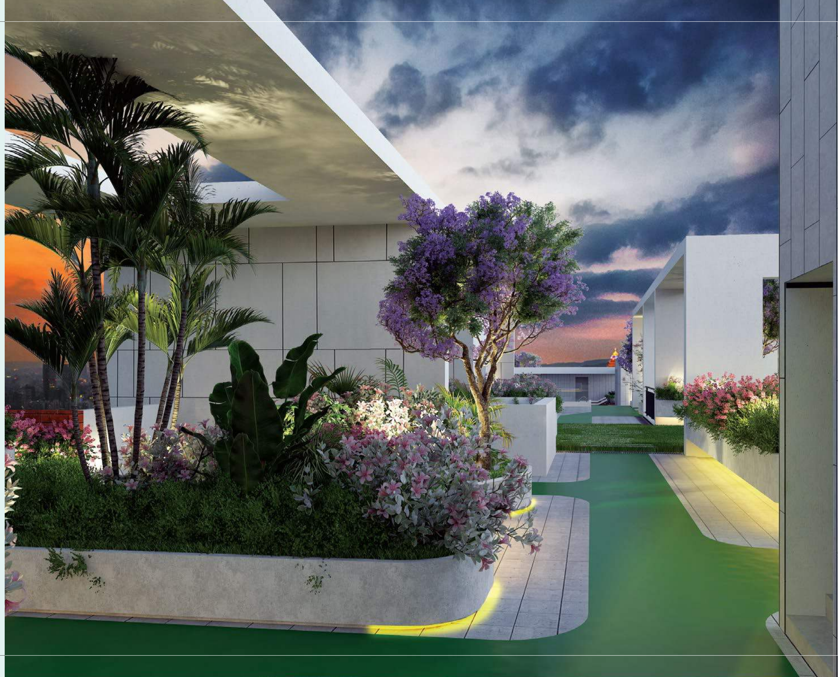
Savor the Flavors of a Perfect BBQ Night