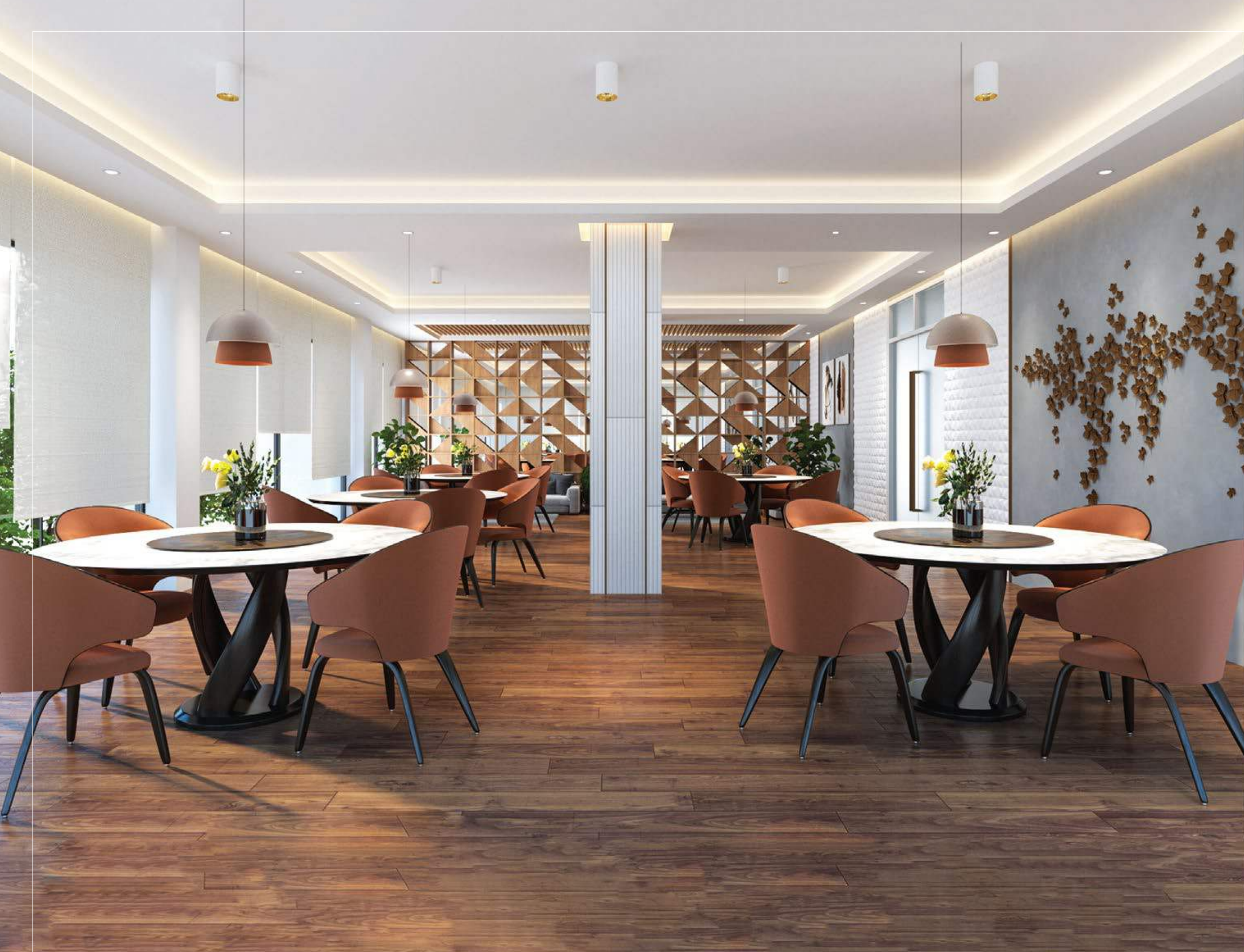
Entertain in Style at the Community Hall