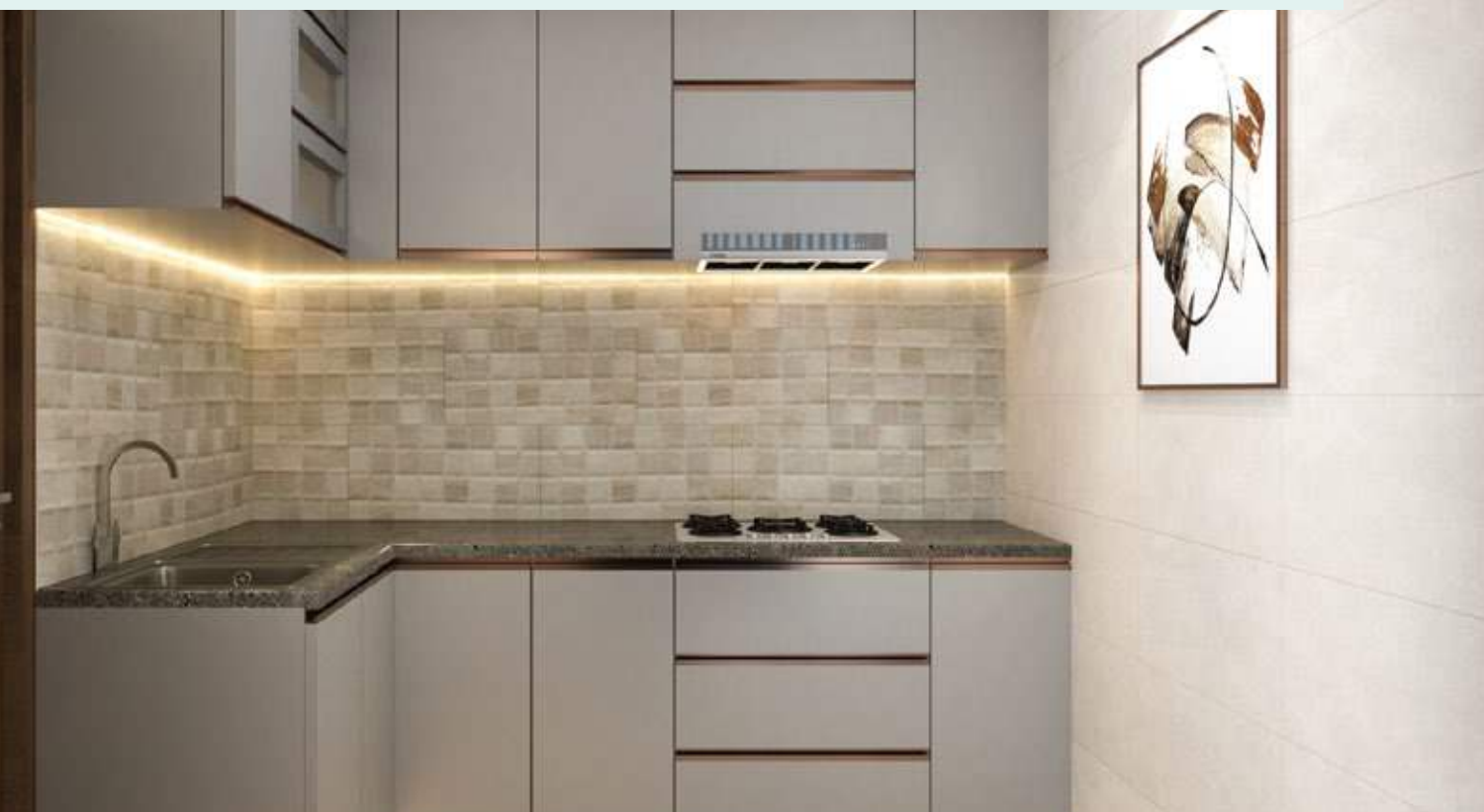
Cook Up Everlasting Memories