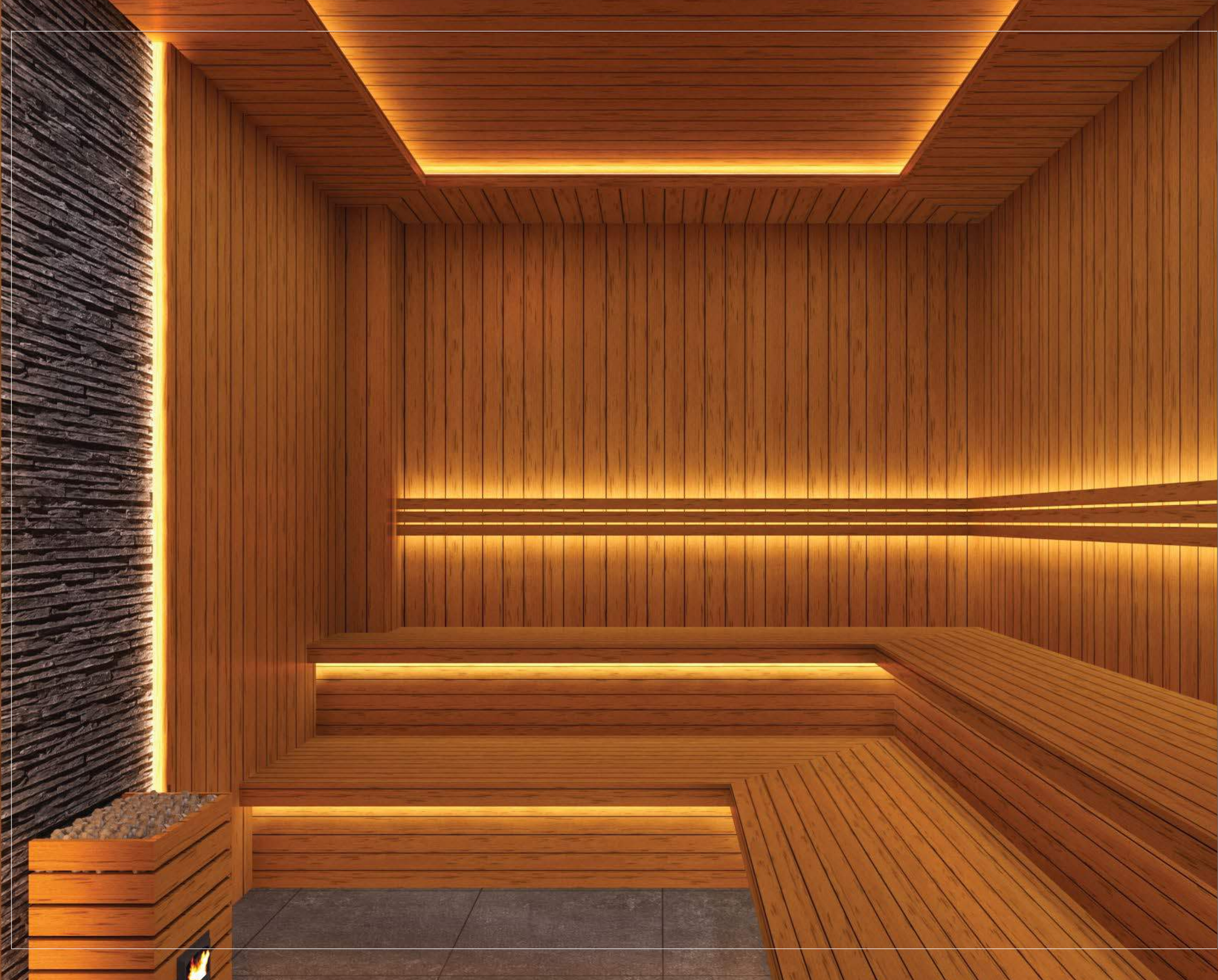
— Feel Revitalized in the Sauna —