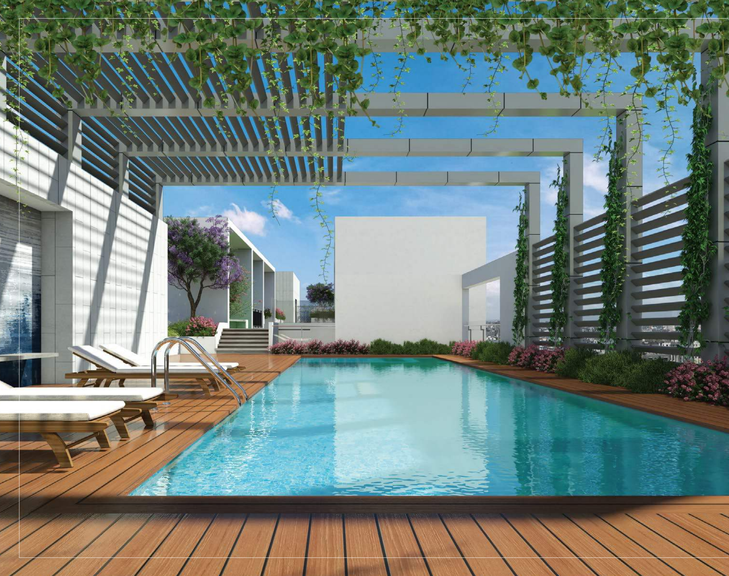
Take a Refreshing Dip