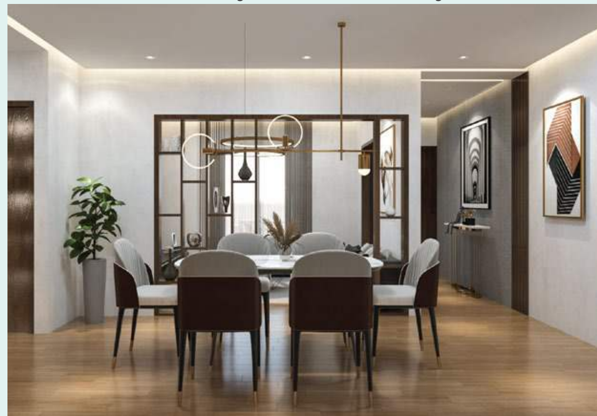
Dine with Style