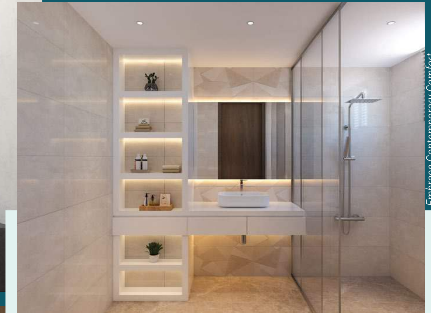
Embrace Contemporary Comfort