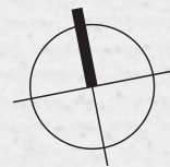
3RD & 4TH FLOOR PLAN 2325 SFT